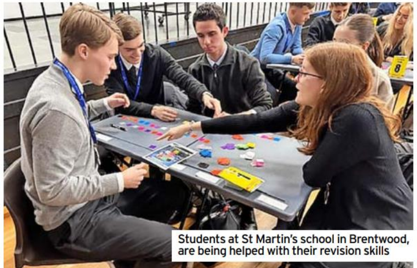
Students at St Martin's school in Brentwood, are being helped with their revision skills

"We want to be constantly upskilling students to make the best use of their free time."