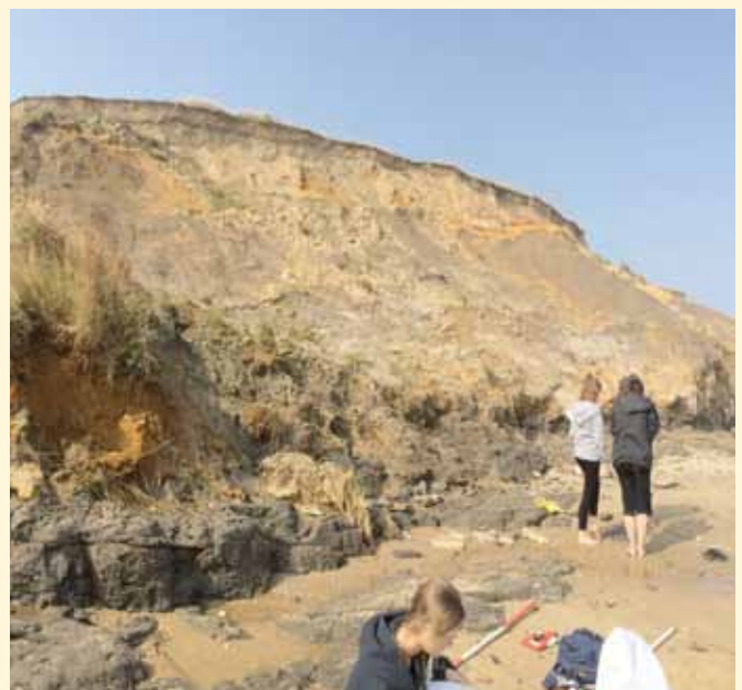
Students hard at work completing a beach profile